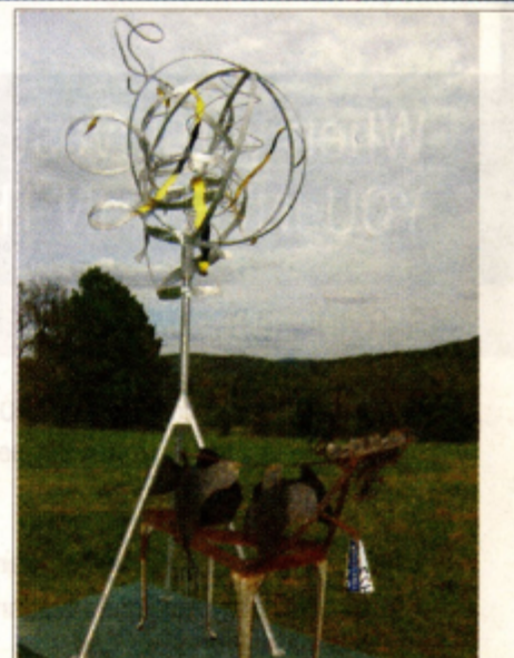
"MOO," by Jodi Carlson

Collaborative Concepts at Saunders Farm 853 Old Albany Post Road, Garrison NY 10524 845.528.1797